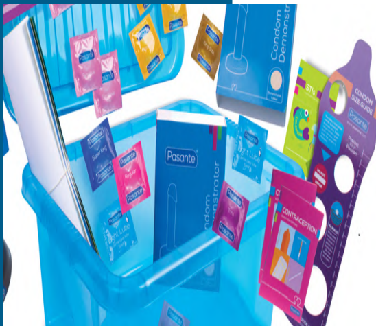
New RSE Toolkit

Pasante are proud to be a partner of the Sex Education Forum and they have worked closely together to ensure this box contains everything you need to run a successful RSE lesson.